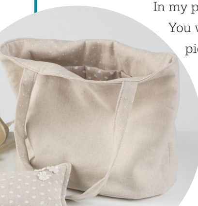
Prototype of my sewing bag.

In my prototype, I only added the one pocket, as in the You will need box, but in the actual embroidered piece, I inserted two pockets.