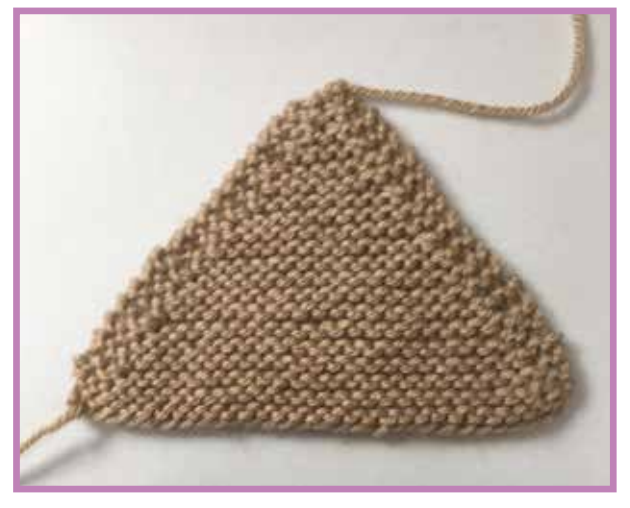
1 Lay the head triangle on a flat surface, as shown.

After countless requests on how to make the basic bear's head, here are some step-by-step instructions, with photos, to help you. Try not to over stuff the body of the bear and keep it in proportion to the head to achieve a uniform effect. Stuff the top of the arms very lightly, so that they will sit nicely when they are attached to the body.