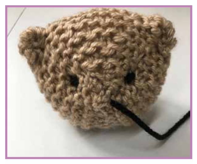
8 Thread a needle with black yarn and embroider the eyes. Pull the yarn inwards slightly to indent the eyes, working from side to side. Don't break the yarn, but bring it out where you want to position the nose.