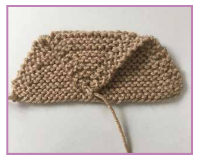
2 Bring the top point to the centre of the base.