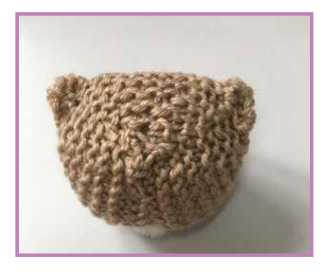
\ensuremath{\mathbf{7}} Sew across the base of each ear to accentuate them and close the tiny gaps.