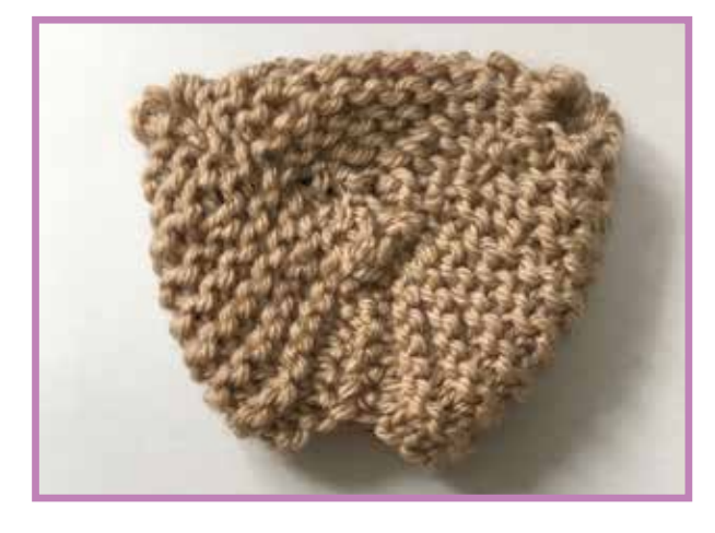
5 This is how your head should look before you begin to add the stuffing.