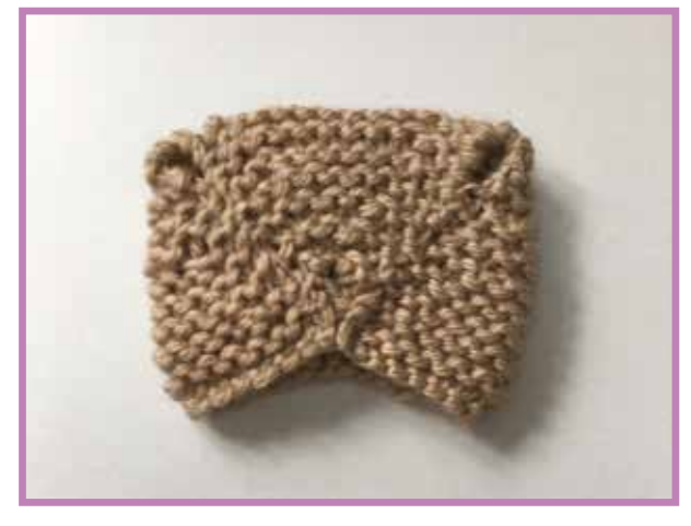
3 Bring the points on each side to the centre point, and sew each side seam of the head using a flat seam, and leaving a tiny section unsewn at the top on either side of the head to form the ears.