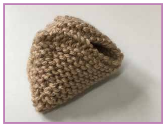
4 Turn the head over and sew a small way down from the nose towards the neck. Leave a small opening to enable you to stuff the head.